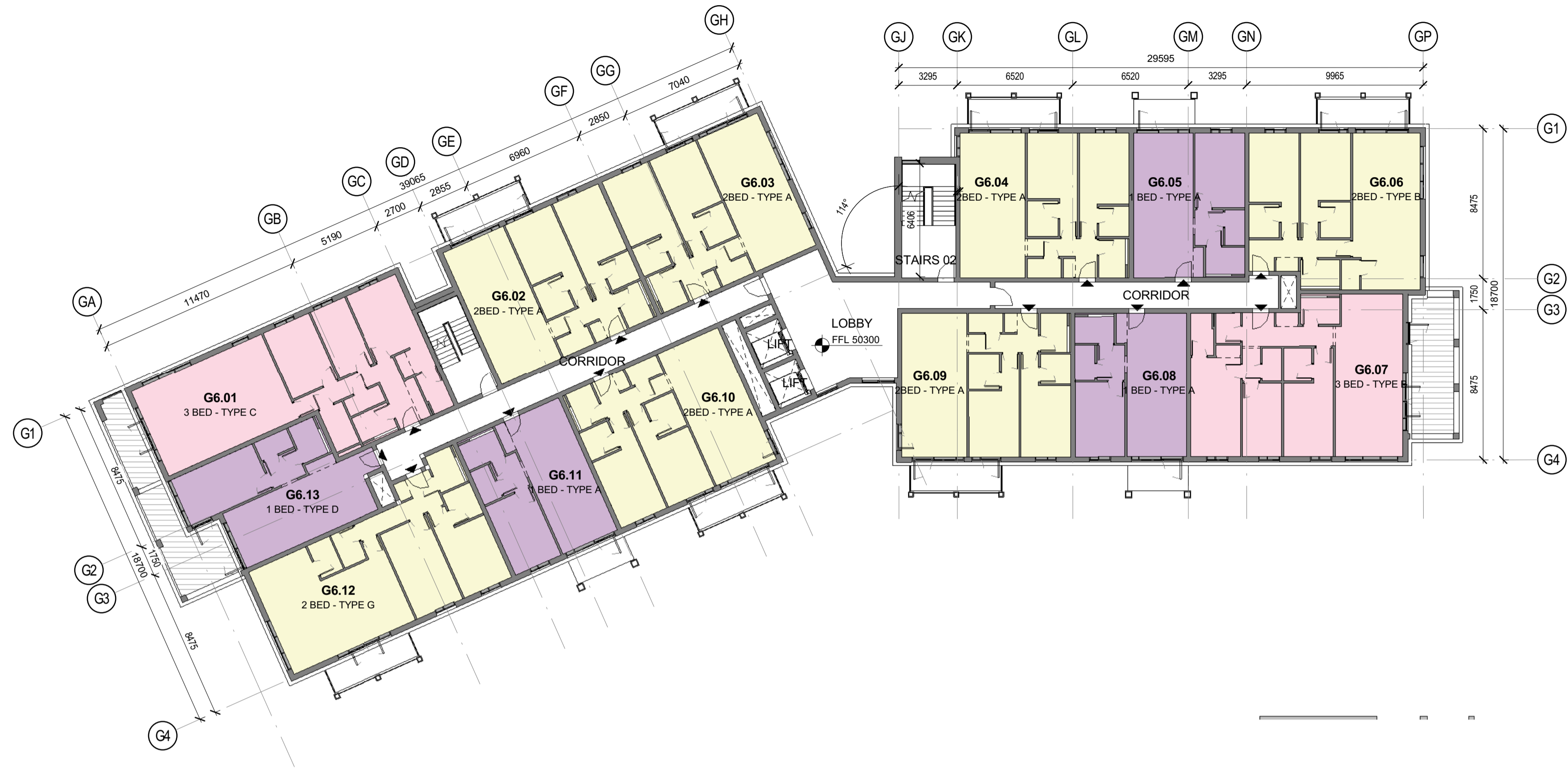
2 G_06 Sixth Floor 1 : 200